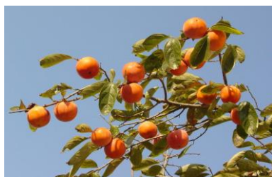
A Japanese persimmon Tree like the one that stood in our yard when I was a child