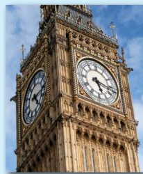
Big Ben is the name of the bell and not the clock tower itself, which is named Elizabeth Tower.